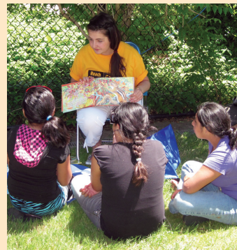
2010 Summer Reading Spot

Launched in the Summer of 2010 at Willamalane Park Swim Center in Springfield, the first Summer Reading